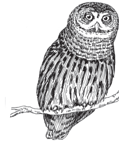
Step 2: draw the owl.

The humor lies in all the steps that are missing. Everyone knows how to draw two ovals and a line. No one, least of all me, knows how to draw the owl.