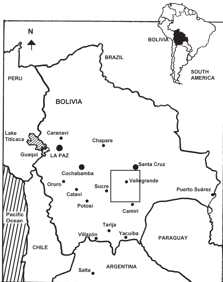
Map of Bolivia Showing the Zone of Guerrilla Operations